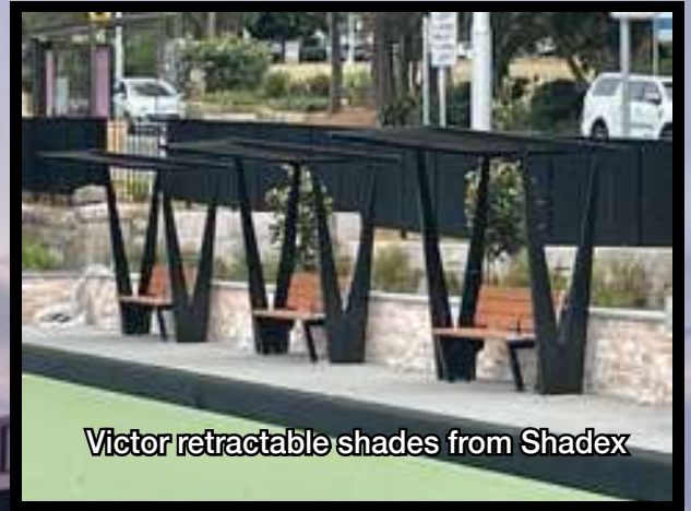
Victor retractable shades from Shadex